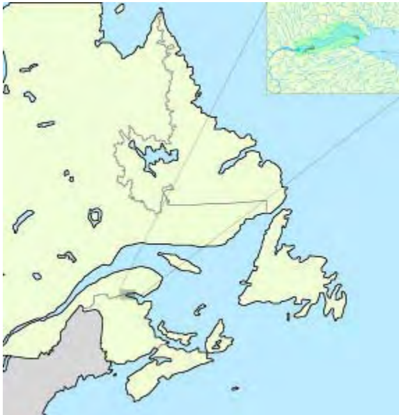
Fig. 1. Location of study area, Bay of Chaleur, NB.

Our study area was located at a spring staging area on the Bay of Chaleur, NB (Fig. 1). This site is the major spring stop-over site for migrating Black Scoters in eastern North America. From 2-5 May 2009, we used standard night-lighting procedures (Perry 2005) and floating mist-nets (Bowman 2007) to capture Black Scoters. Females were aged by probing the bursa. Females with no bursa, or bursal length less than 10 mm, were classified as adults and sub-adults, respectively, and, were retained for instrumentation. Within 24 hours after capture, birds underwent an intra-abdominal surgery to implant PTT 100 satellite transmitters (39 g) manufactured by Microwave, Inc., Columbia, Maryland. Ducks were released near their capture site.